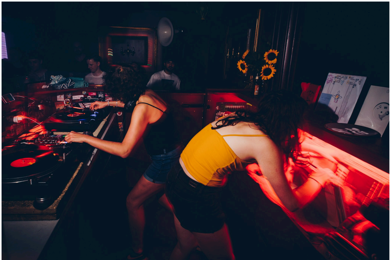
Oct 2019 at T4T LUV NRG x Shoot Your Shoot at Berkeley Suite, Glasgow, Scotland